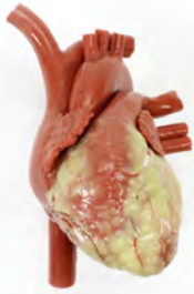
(#1253) $2,185. CABG HEART PATENT Realistic, soft, patent heart with suturable native coronary sites