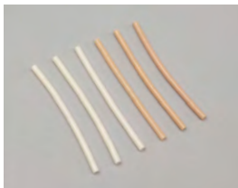
(#1500) $110. 3 MM VESSEL 6-PACK Includes 3 target and 3 graft vessels, approx. 8cm long, 3mm OD/0.8mm wall