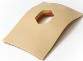
(#1444) $515. MINI-STERNOTOMY BIB 6cm x 8cm For MIS practice, provides the limited anatomical access typical in sternal access procedures