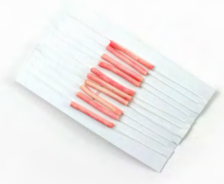
(#1187) $205. NATIVE CORONARY ARTERY 10 pack Replacement segments for CABG Heart native coronary sites