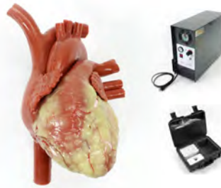
(#1339) $13,075. CABG BEATING HEART W/ ANCILLARY Realistic, soft, beating heart with suturable native coronary sites for on and off-pump training