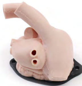
(#1074) $365. MITRAL WITH ATRIA Suturable valve and annulus with prolapsed posterior leaflet, for valve repair