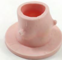
(#1065) $205. AORTIC ROOT Anatomically accurate for valve implantation training