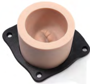
(#1320) $185. NEW MITRAL VALVE PROLAPSE TRAINER Delicate prolapsed posterior leaflet for incision and suture repair training