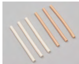
(#1501) $110. 4 MM VESSEL 6-PACK Includes 3 target and 3 graft vessels, approx. 8cm long, 4mm OD/0.8mm wall