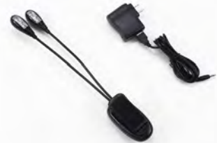
(#32003) $59. PORTABLE LIGHT Repositionable and compact, with batteries and power cord