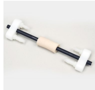
(#1388) ROD ASSEMBLY WITH VESSEL SUPPORT PAD Replacement rod, vessel adaptors and vessel support pad $55.