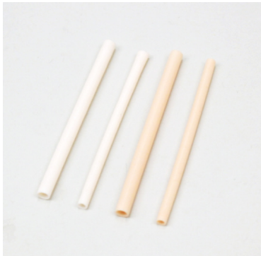
GRAFT & TARGET VESSELS (#1371) 4mm Target Vessel (#1370) 4mm Graft Vessel (#1368) 3mm Target Vessel (#1366) 3mm Graft Vessel $16. EA 5-piece minimum order for each