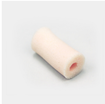
(#1387) VESSEL SUPPORT PAD Replacement vessel support pad for stabilizing vessels during anastomosis $15.