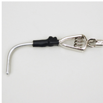
(#1386) VESSEL CLIP Replacement clip for securing graft vessel for anastomosis $15.