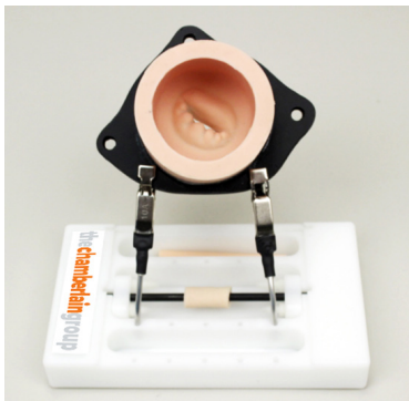
(#1320) NEW MITRAL VALVE PROLAPSE TRAINER Prolapsed posterior leaflet is reinforced to allow for incision, repair, and annular ring replacement $89.